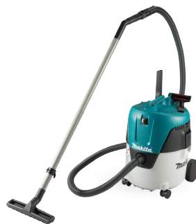
VC2000L Corded vacuum cleaner