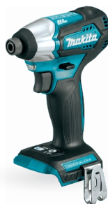
DTD157 18V 1/4" Impact driver