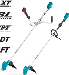
DUR190U / DUR190L 18V 300mm String trimmer