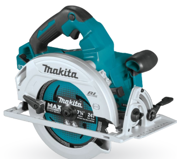
DHS780 18Vx2 7-1/4" Circular saw