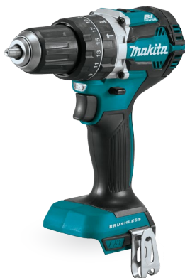
DHP484 18V 1/2" Hammer drill