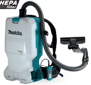
DVC660 18Vx2 Backpack vacuum cleaner