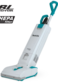
DVC560 18Vx2 Upright vacuum cleaner