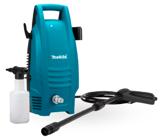
HW101 Corded pressure washer