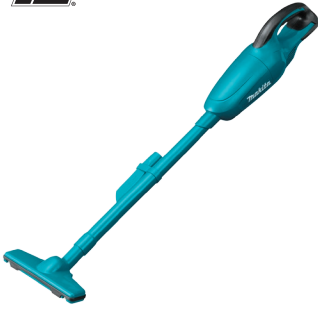
DCL180 18V Stick vacuum cleaner