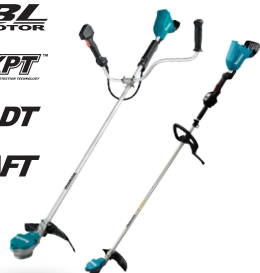
DUR368A / DUR368L 18Vx2 350 mm Brushcutter