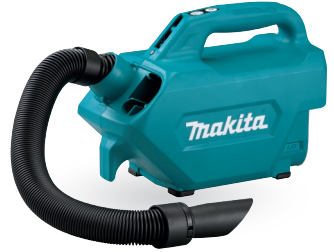
DCL184 18V Vacuum cleaner