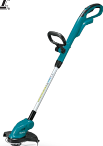
DUR181 18V 260mm String trimmer