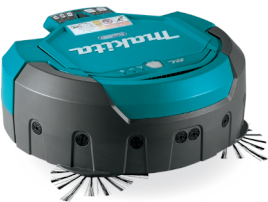
DRC200 18Vx2 Robotic vacuum cleaner