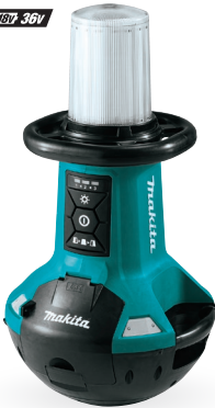
DML810 18V Work Light