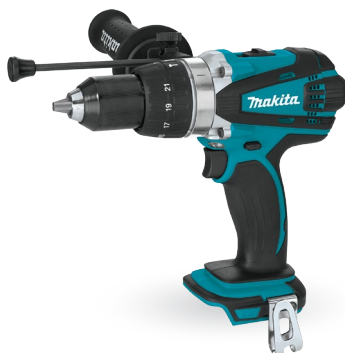
DHP458 18V 1/2" Hammer drill