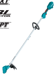
DUR192L 18V 300mm String trimmer