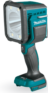
DML812 18V Flashlight/Spotlight