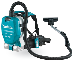
DVC261 18Vx2 Backpack vacuum cleaner