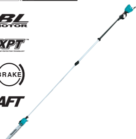
DUA301 18Vx2 12" Pole saw