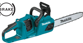
DUC355 18Vx2 14" Chainsaw