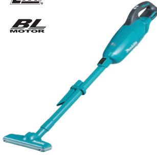
DCL281 18V Stick vacuum cleaner