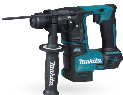
DHR171 18V SDS-PLUS 11/16" Rotary hammer