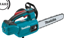
DUC254 18V 10" Chainsaw